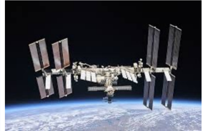
Sky Event Almanacs